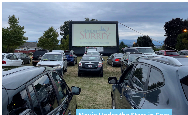
Movie Under the Stars in Cars