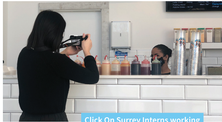
Click On Surrey Interns working with businesses