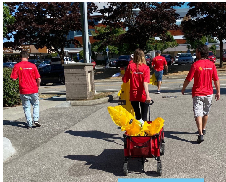
Community Clean Up