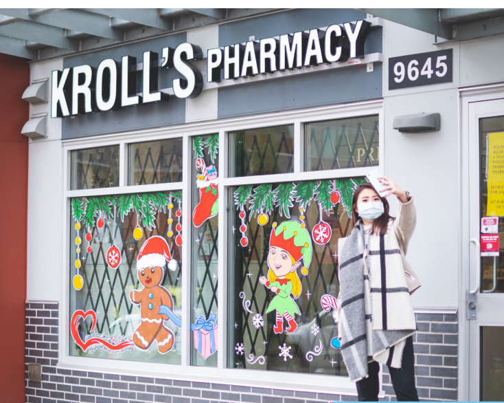
Santa Window Walk