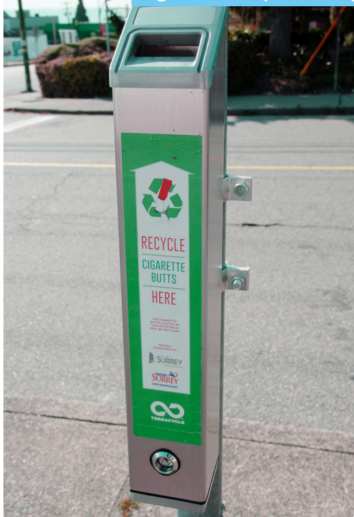
Cigarette Receptacle Project