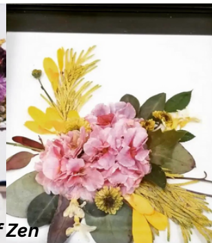
Artwork by: House of Zen